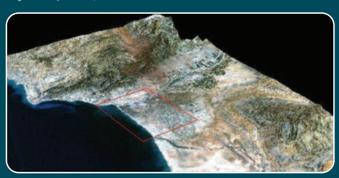
3D visualisation of the study area