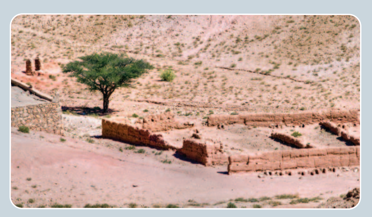
A unique habitat that deserves analysis and care

To monitor this fragile and changing landscape, researchers from the Image et Reconnaissance de Formes – Systèmes Intelligents et Communicants (IRF–SIC) laboratory of the Ibn Zohr University in Morocco created thematic maps of the Agadir region using remote sensing and GIS technology.